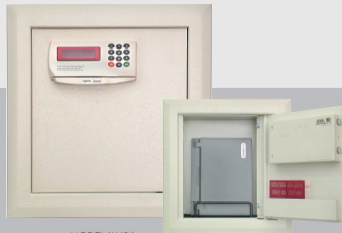
MODEL W406 WALL-SAFE