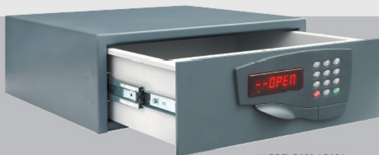
MODEL D103 / D104 DRAWER SAFE

Our collection of electronic in-room safes will exceed their expectations.