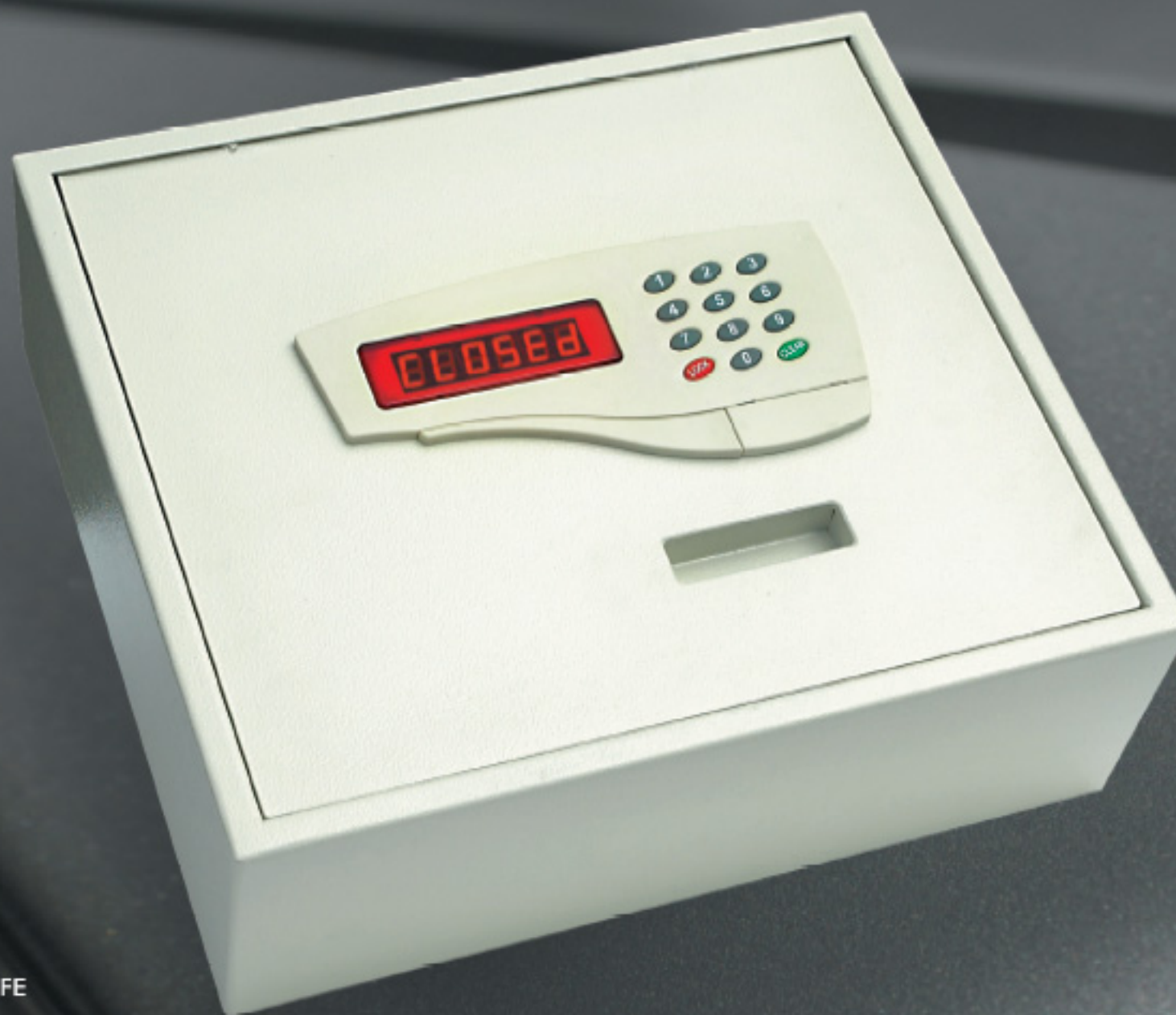
TOP OPEN SAFE