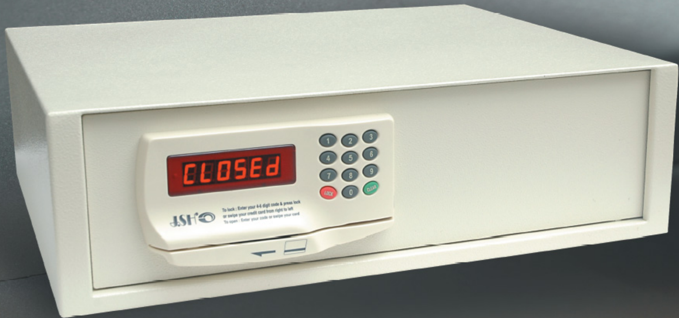
MODEL TX 501