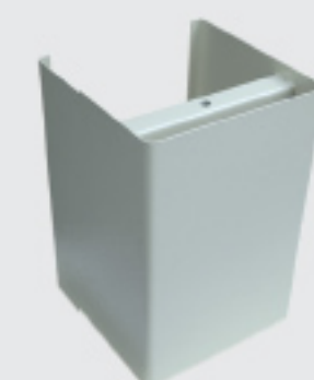
Pedestal Different types