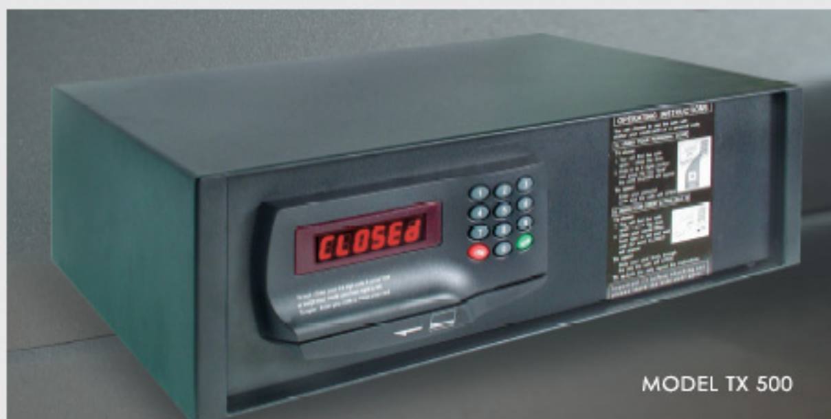
MODEL TX 500

Our customers choose us for our high standards and deep commitment to them. We strive to exceed our own high standards year after year, and will always provide customized solutions to meet our customers individual needs and demands.