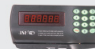
Raised Illuminated Key buttons