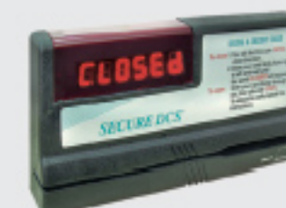
Panel Series C