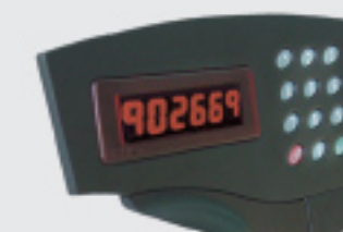
Flat Panel For series D